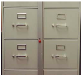
Knob with stop facing upward